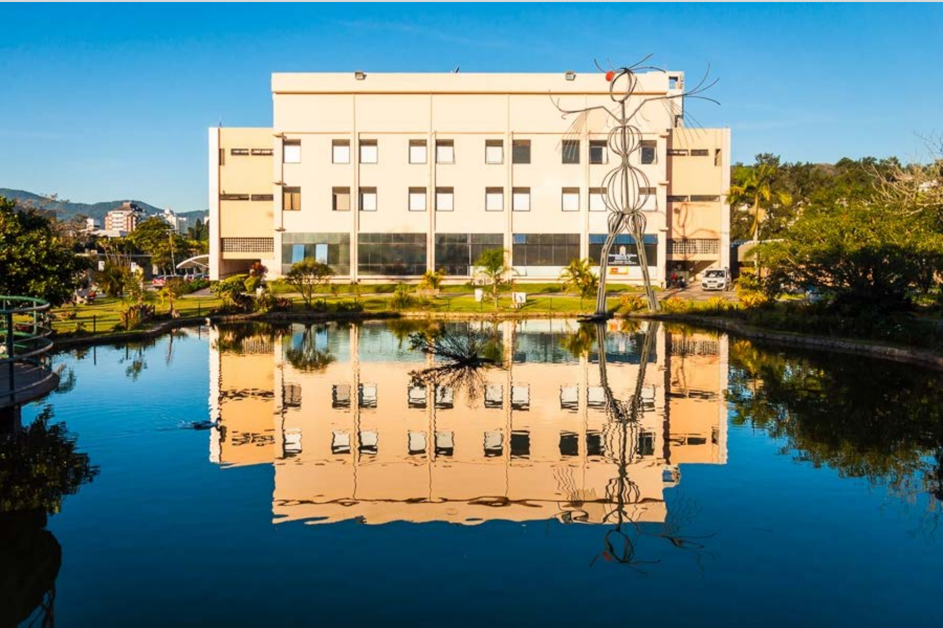
Culture and Events Center