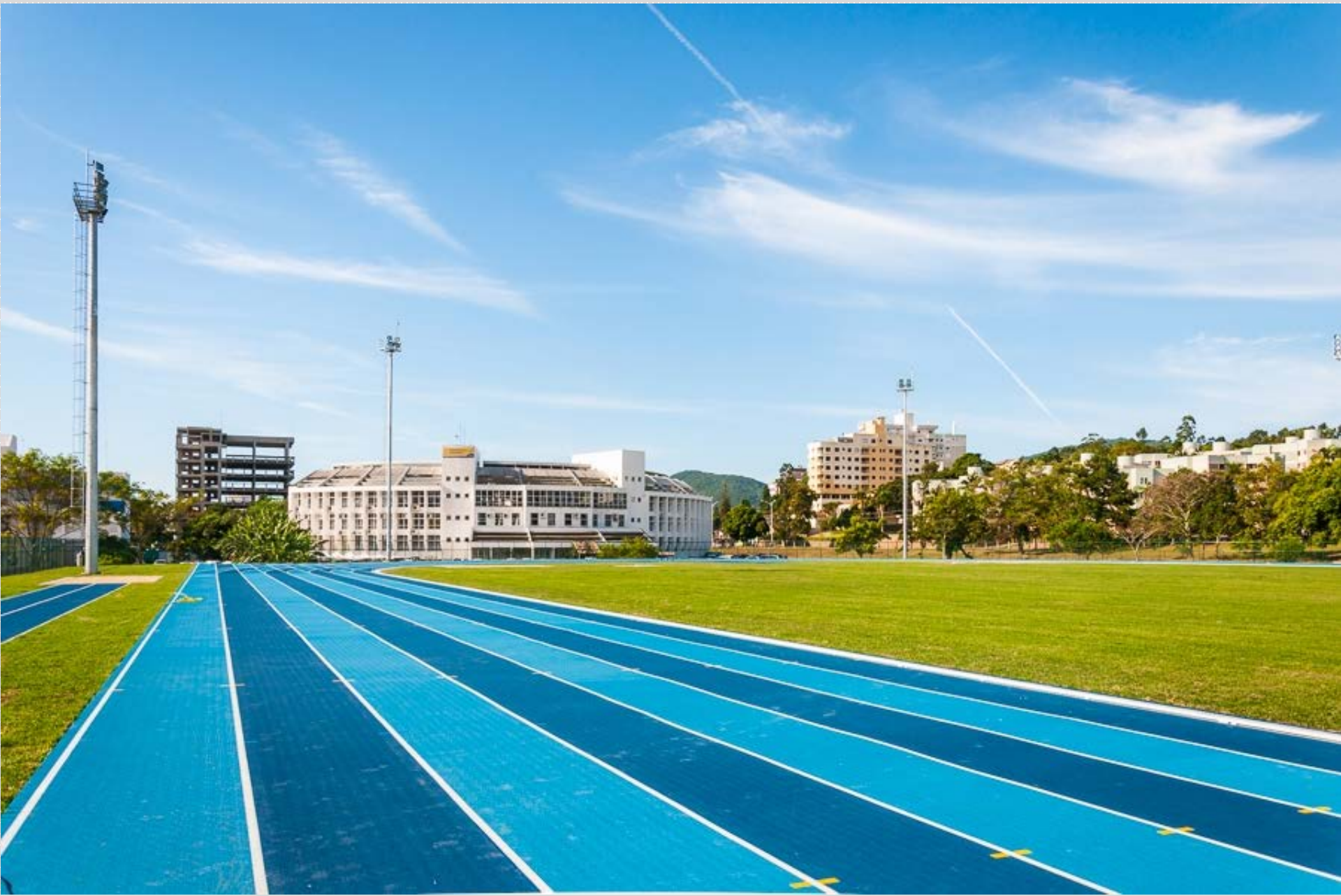
School of Sports