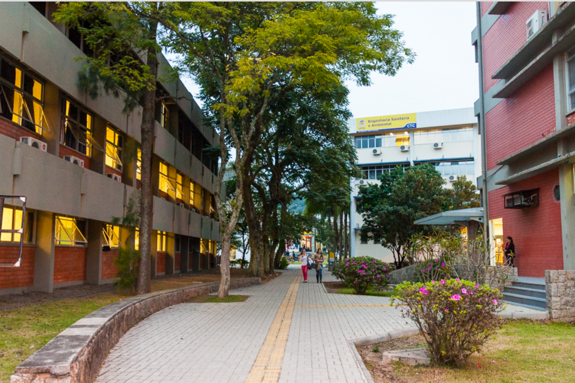
School of Technology