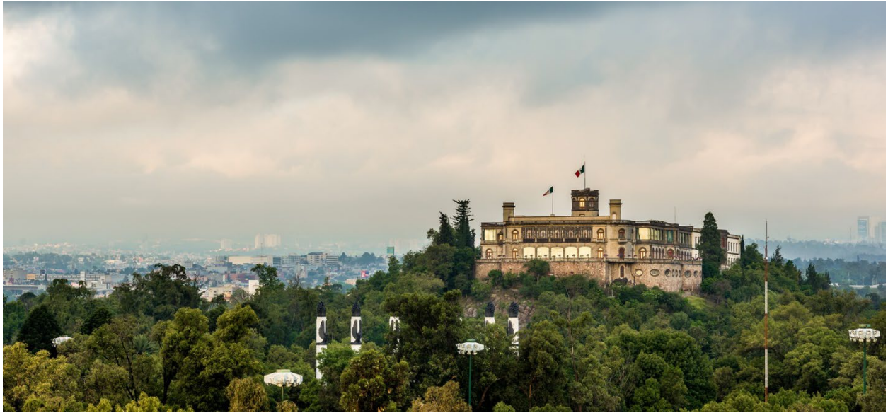
Parque y Castillo de Chapultepec, Mexico City