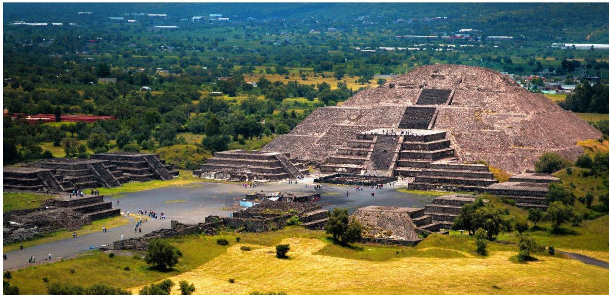
Pyramid of the Moon, Teotihuacan