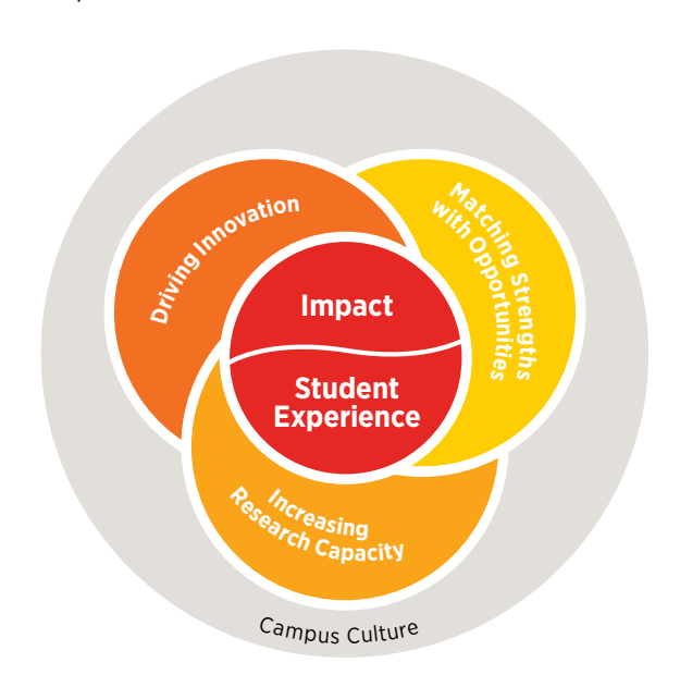
Figure 3 — The Research Plan

As with Eyes High, our Research Plan is an evolution of the previous plan that enabled us to advance on the national stage in almost all research competitions, including major programs such as Canada Excellence Research Chairs, Canada First Research Excellence Fund, Canada Foundation for Innovation, Banting Fellowship and Vanier Scholarship Competitions, and Tri-Council competitions. Our clear articulation of research priorities, reflecting our scholarly excellence, and our institutional investments in them, were key components in our success.