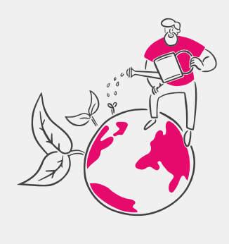
Food, land, agriculture, and lifestyle