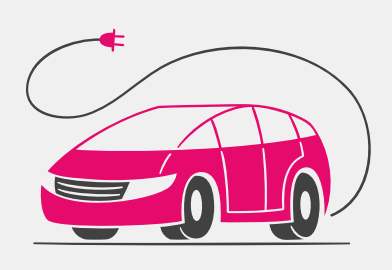
Clean and active transportation