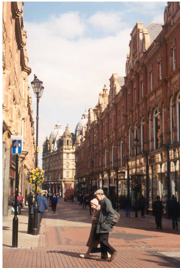
Figure 5.1 Leeds – Pedestrian Zone

development agency and the integrated government office. Along with being the location of regional government headquarters, Leeds is the largest employment center in the region with 425 000 people employed, or 19% of the regional workforce. The importance of Leeds as a center of employment will remain strong as it is projected to enjoy the most robust growth in the Yorkshire Humber region between 2000 and 2010. It is expected to provide 40% of the region's additional jobs in that period. (Leeds City Council, 2000a).