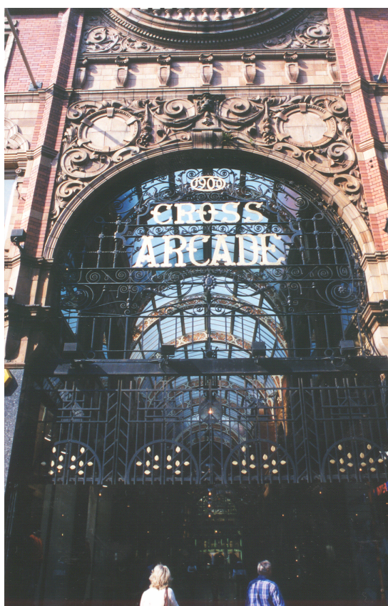
Figure 5.3 Leeds – Shopping Arcades.

The segmented nature of the labour market has resulted in a situation that is often referred to as producing “a two speed city,” defined by inner and outer areas. This dichotomy is characterized by concentration of residents with lower skill levels, traditionally employed in the manufacturing sector, in the inner city. Their access to opportunities in the service sector is limited, mostly to low paying, temporary positions (Leeds City Council, 2000b).