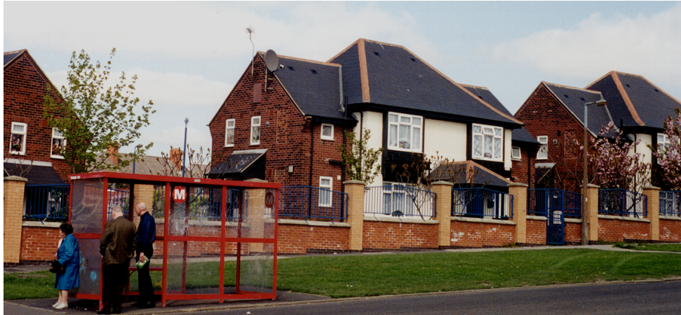
Figure: 5.7 Urban Regeneration of Council Housing Estates.

events where local residents were asked to make radical decisions about the provision of services in their community and the remodelling and demolition of the physical environment (Leeds City Council, 1999b)