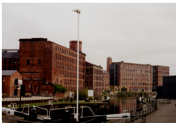
Figure 5.5 Waterfront Development.

purchase reclamation, physical improvements and infrastructure development. The LDC placed a premium of importance on the creation of commercial developments that encouraged the participation of the private sector. The development corporations operated through the provision of tax breaks, subsidies and the provision of infrastructure; the use of all led to the success of the Leeds Development Corporation in achieving a 1:5 leverage ratio of private investment (DETR, 1998b, p.4). Along with the emphasis on the development of commercial office space, and the reclamation of derelict, underutilized and contaminated land, the LDC also concentrated on developing the city's infrastructure as a recreation and tourism center. A goal of the Leeds City Council is the creation of the '24 hour city,' filled with vibrant venues and localities that represent non-stop hubs of activity.