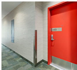
Studio apartments $105

For more information or to book a cleaning, email residence.housekeeping@ucalgary.ca