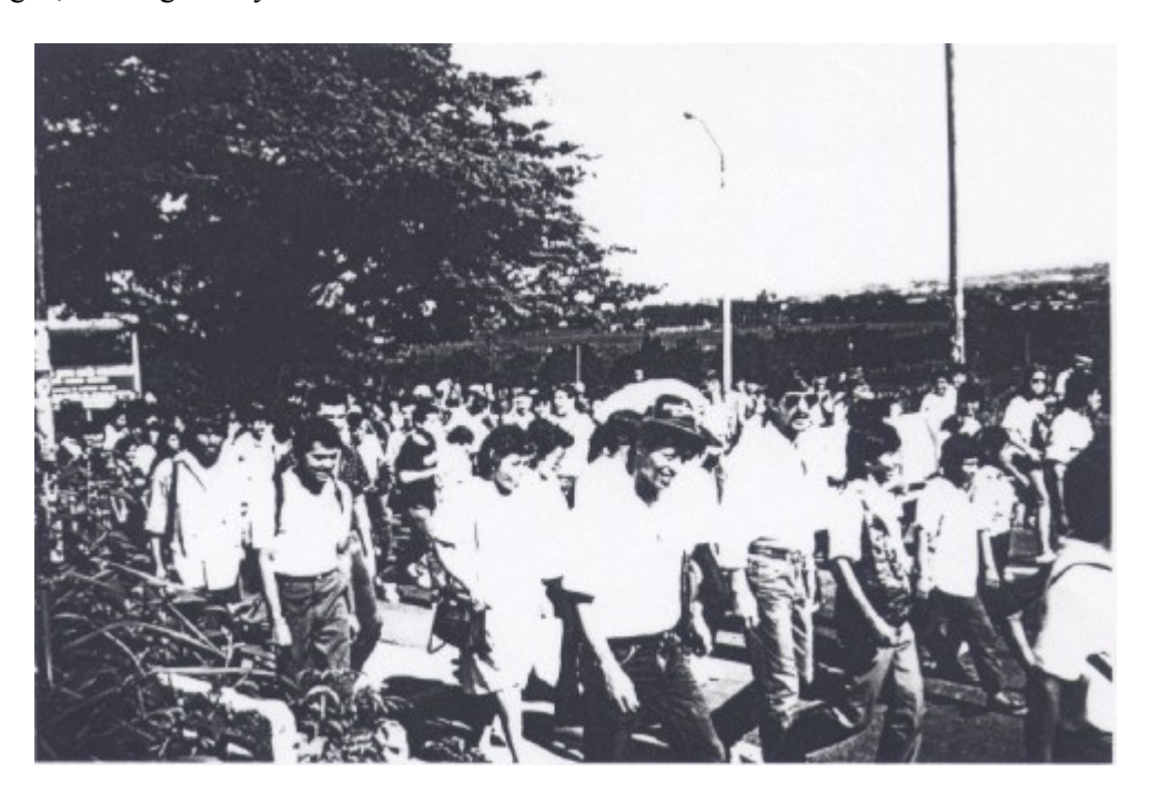
Appendix 1 Managua, Nicaragua July 1990

This paper has addressed how I as a social worker look at the world in which social work works. It also addresses the paradigm or approach that is used, including the method when helping others. Finally by looking at my personal self it discusses how I as a person fit into all of this. I therefore feel that this is a good representation of what my approach to social work is. However, anyone who has ever got his/her pictures back after being on trip and has shown them to others, will likely be aware of the feeling that, "well this is what I saw but it doesn't really capture what it felt like to be there." So to is the feeling I have with this paper. I do not believe that this really expresses my entire position, yet I do believe that this is representative of how I think and look at things as a social worker and how I want to intervene with others. Because reality is constantly changing, nothing is ever complete. For this reason we must always be open to change and new ideas. We should test and evaluate these ideas, but do so on an open, holistic manner. The minute we become closed and think we have an all encompassing view and think that we have reached a limit on the amount to be learned is the minute that we shut ourselves off to the continuing process of life.