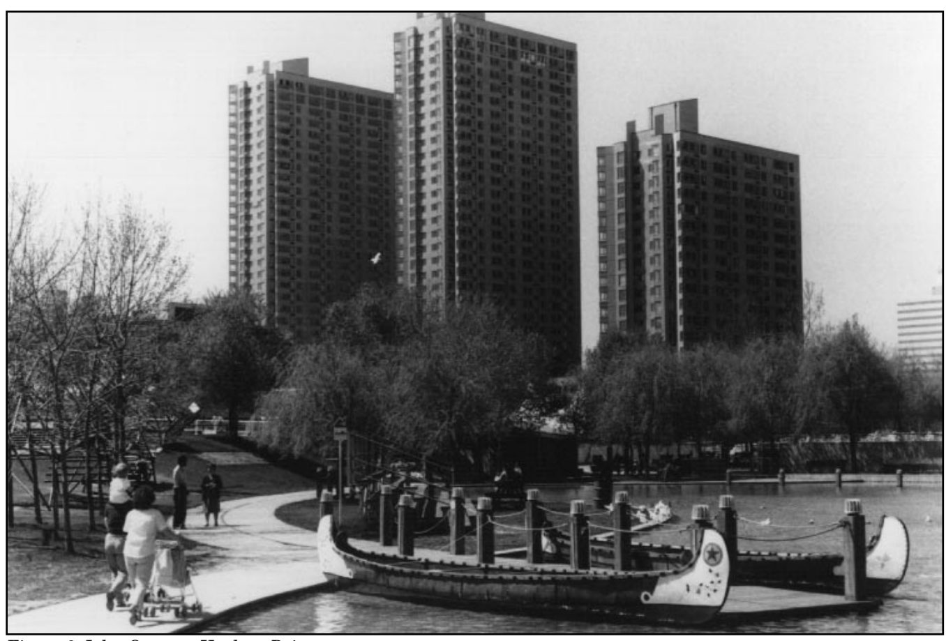
Figure 3 John Quay — HarbourPoint

public spaces, diminishing their attractiveness. While this area is pleasant, its wider effect is lost in a sea of incomplete construction.