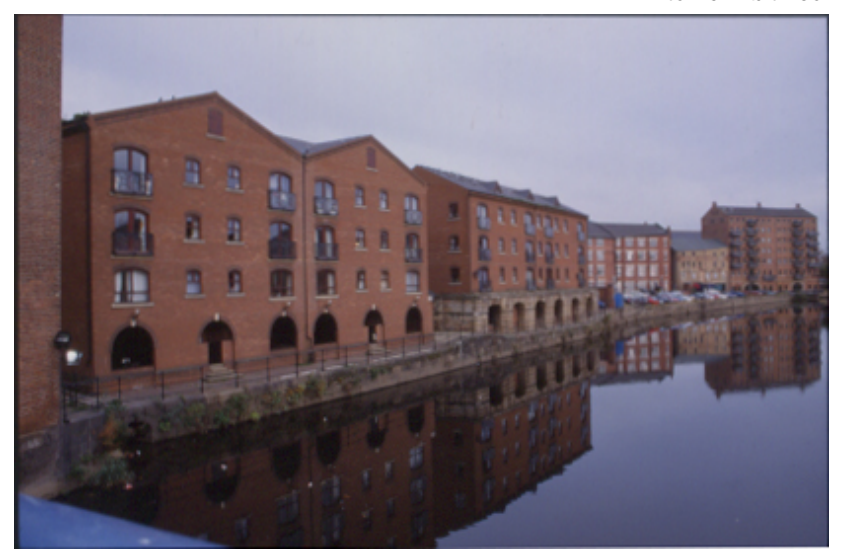
Figure 7.6 Rebuilding the Industrial Heritage in Leeds