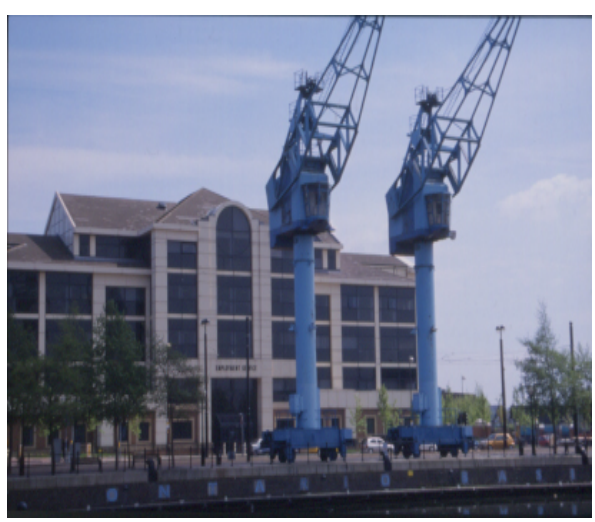
Figure 7.3 Enterprise Zone at Safford Quays

Manchester and Leeds, providing high quality urban environment. Considerable public investment led to infrastructure environmental improvements and significant private resources were committed to physical development of housing, social, commercial and industrial space. UDCs managed to act as a catalyst enabling private and investment to contribute to different These 'market regeneration schemes. facilitators' operated with substantial grants to carry out their strategic 'pump-prime' strategies manner sensitive economic to circumstances property market and fluctuations.