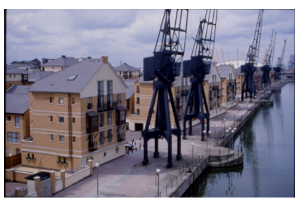
Figure 7.4 New Housing, Royal Docks London

English Partnerships (EP) were established with a mandate to facilitate urban regeneration and to develop efficient partnerships rather than a history of defeats of local authorities and community groups (English Partnerships, 2000; Yelling, 1999). EP capitalized on the legacy of UDCs and the critical mass of property-led regeneration created over the years. The agency successfully manages the regeneration of the Royal Docks in London, Europe's largest development site (Figure 7.4).7 objectives, although at a much more moderate scale, are pursued in Manchester. Manchester City Center, devastated by the recent IRA bombing, is striving to become the cultural, educational and financial hub of North Western England. In their new role of 'enablers', EP focused on building bridges among local authorities, developers, local communities and other central government institutions.