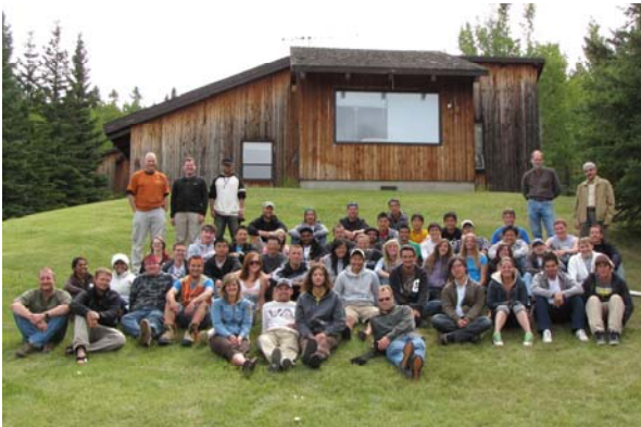
Survey Camp August 2010